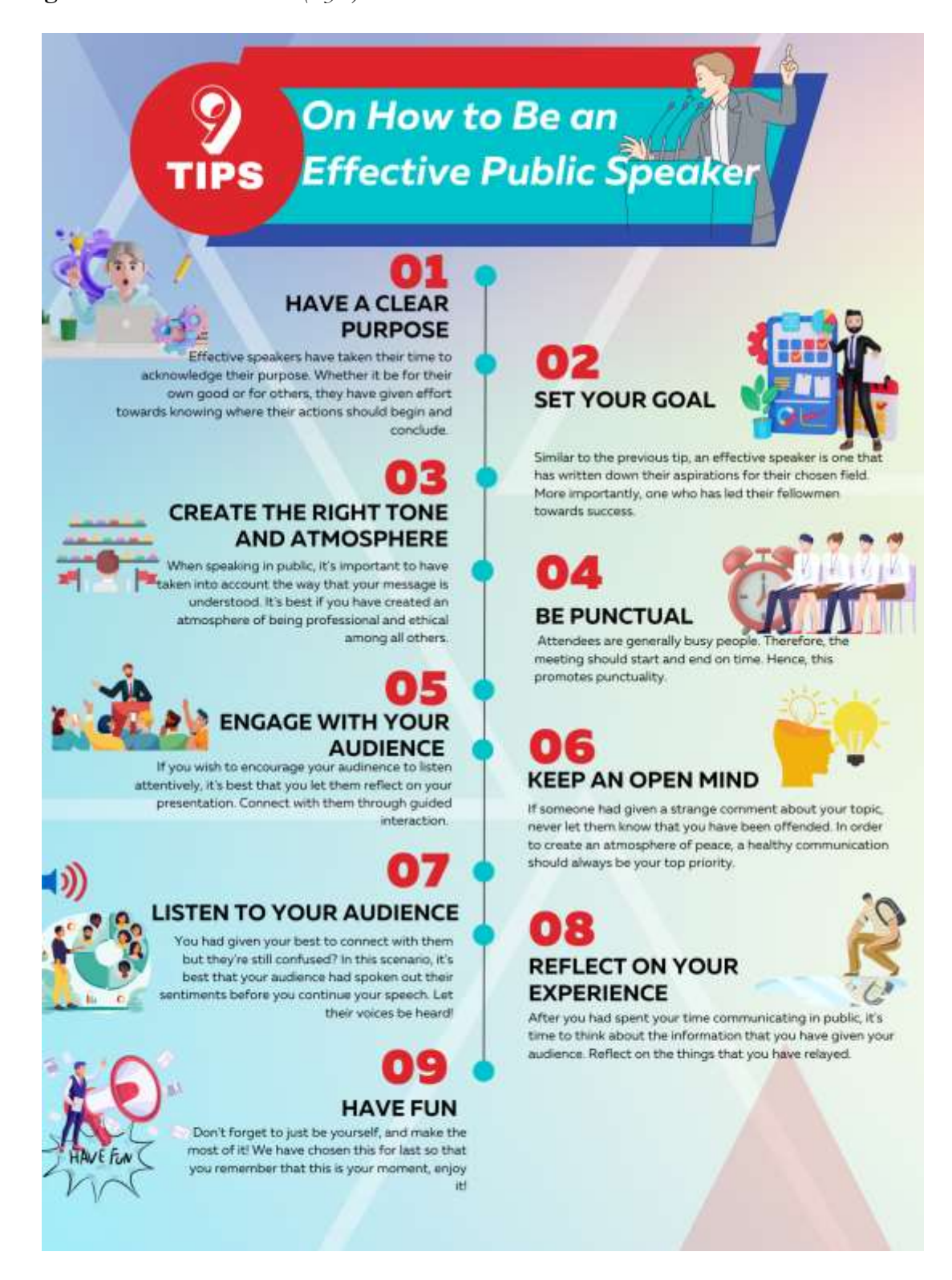
Figure 1. The Authentic Text (Flyer)