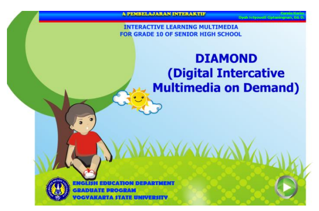
Figure 2: Multimedia-based Listening Materials

The supplementary multimedia-based listening materials consist of three units which have different lesson focus. The units were developed mainly based on the result of needs analysis. The needs analysis guided the researcher to develop listening materials for the tenth graders in the first semester using Curriculum of 2013. Due to the time constraint and urgency of the materials, there were only three developed units. Unit 1 talks about descriptive texts, unit 2 discusses recount texts, and unit 3 was about narrative texts. The product of this study can be shown in figure 2.