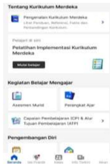
Figure 2. Appearance of PMM

One of the most helpful features of PMM is the real action feature. This feature comes with self-training where teachers are required to apply or implement what they have learned. This feature is certainly very helpful for teachers, including mathematics teachers, because they not only receive the content of the self-training provided but also directly implement what they have learned. In real action, other teachers can also provide feedback to improve the teacher's teaching practice.