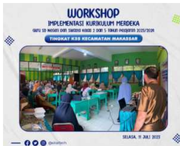
Figure 3. Merdeka Curriculum Implementation Workshop by P17.

Apart from P2, many teachers also presented the material. One of them is P17 which can be seen in figure 3 below.