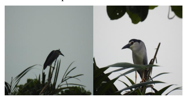
Fig. 2. Black-crowned Night-heron in Sumatra

observation, did not make any aggressive gesture, and was not agitated by other flyingthrough birds. It stayed at the perch until the observer left the site an hour later. Subsequent observation made on the next day re-spotted the presumably same individual perching at around the same place and time. No other individual was observed until the waterbird survey concluded in April 2018.