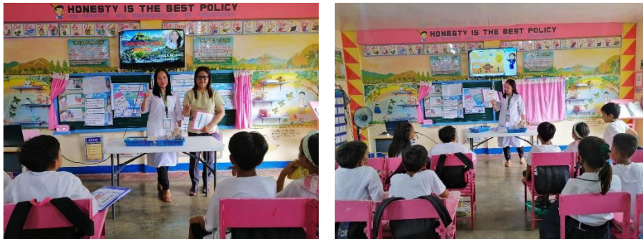
Image: Learning preparation stage

In the preparation stage, teachers provide motivation to students so that they can get out of feeling stressed and become interested in learning. These motivational words aim to raise students' enthusiasm for learning.