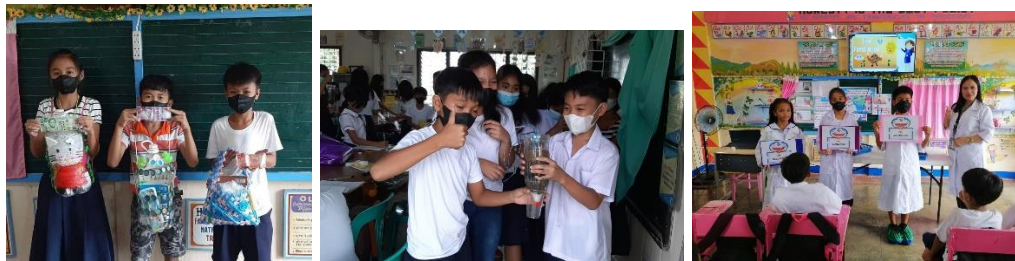
Image: Learning practices at San Fabian Elementary School, Philippines

In the training stage, learning is designed in such a way that students feel like they are playing. The method used can be a quiz or other method that attracts students' attention. Apart from that, pictures or animations are also used to make students interested and happy in learning. To increase student activity, prizes and praise are given to students who are active in the quiz. Prizes given include stamps and stars. However, if students make mistakes, they will receive punishment. The punishment is separation from class and having to sit alone in silence. Usually, punishment is given if a student hurts another student.