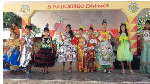
Image: During a fashion show at the Parents' Day event

also participate by wearing professional costumes. Activities like this provide students with hands-on experience and make learning more interesting.