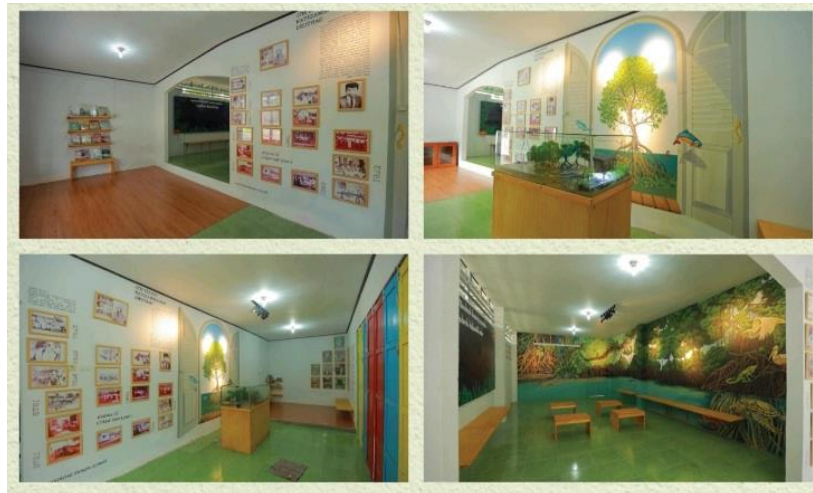
Figure 2. Room Interior of the Mangrove Literacy House at Muhammadiyah Islamic Junior High School, Gantung, East Belitung