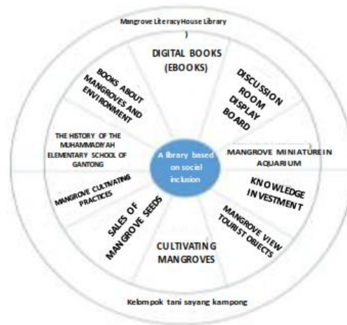
Figure 4. RML Library Collaboration Pattern with the Sayang Kampong Farmers Group based on social inclusion in the preservation of mangrove forests.