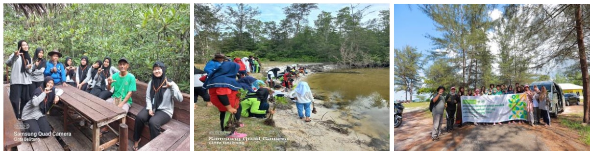
Figure 3. Social activities in the Sayang Kampong Farmer Group of Sukamandi Village, Damar District, East Belitung

"...Everything I do is solely to seek God's blessing. I only sell mangrove seeds to people who destroy them, to school children and activists it's free..."