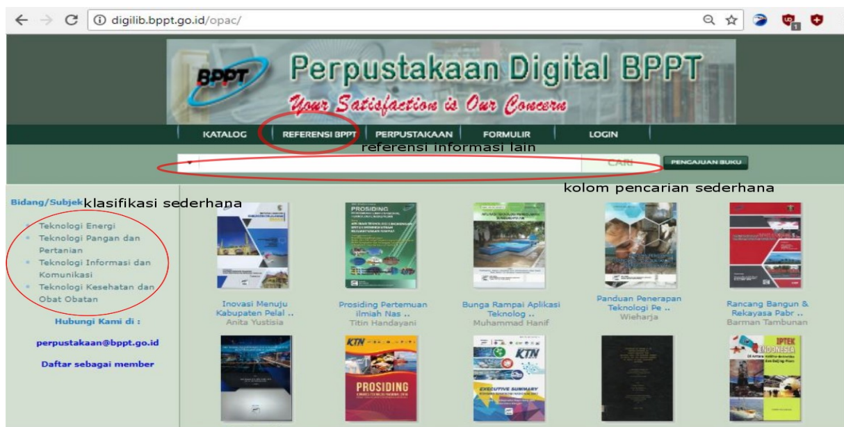
Figure 1. BPPT Library Online Catalogue Interface ( http://digilib.bppt.go.id/opac/ )

Coverage can be observed from information completeness, accuracy and information suitability and the presentation provided by information search tool (Saufa dan Wahyu, 2017). BPPT Library was able to cover many and varied collection types on the related subject in the collection database to be utilized by users. This was also supported with clear classification using classification scheme National Technical Information Services (NTIS) and complete collection bibliography entry up to abstract. In addition, users were given various choices of other references which can be used through the menu available in its online catalog. BPPT Library information retrieval system has been able to provide complete, varied and functional information but still required some more attention and improvement in several aspects, such as adding simple classification on the left navigation as to ease users in selecting information based on chosen subjects, improvement in input and cataloging system related to collection availability in accordance with catalogue and collection bibliographic data, creating search feature not limited to collection title, and improvement in its OPAC information retrieval tool application.