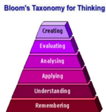
Figure 1. Revised Bloom's Taxonomy

through the use of thought-provoking questions that spark curiosity (Soysal & Soysal, 2023). Such questions can stimulate students to delve deeper into subject matter, reconstruct knowledge to solve problems, and establish logical connections between ideas, thereby enhancing their interest and enthusiasm for learning. Moreover, questions designed to hone thinking skills can empower students to formulate solutions to the problems presented. To effectively craft such questions, teachers require not only broad knowledge but also a nuanced understanding of their subject matter, ensuring that the questions posed can guide the learning process toward its intended objectives. The questions teachers utilize in the learning process can be tailored to align with the cognitive levels outlined in Bloom's Taxonomy. Cognitive levels are a crucial concept in education, designed to identify and differentiate students' thinking abilities. Bloom's Taxonomy provides a valuable framework for understanding and classifying these levels, ranging from basic to more complex. Anderson and Krathwohl's Revised Bloom's Taxonomy categorizes the dimensions of cognitive processes into six distinct levels: remembering (C1), understanding (C2), applying (C3), analyzing (C4), evaluating (C5), and creating (C6).