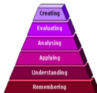
Figure 1. Revised Bloom's Taxonomy