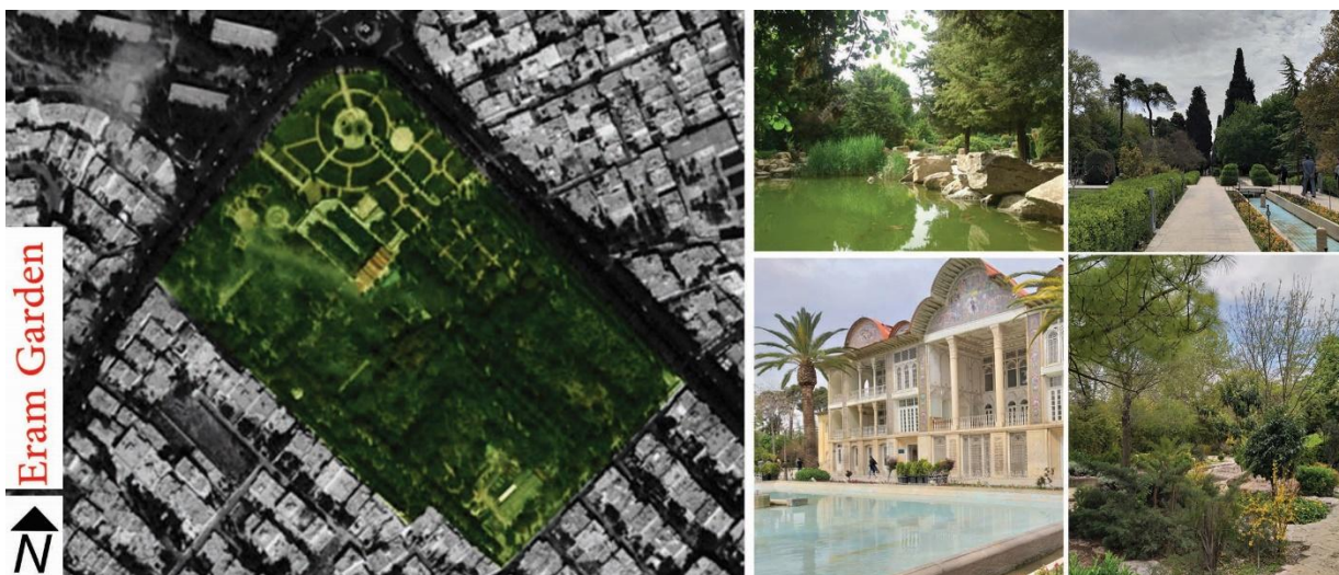
Figure 2. Aerial Photo of Eram Garden and Pictures of its Space.

To inquire about the research issue, Eram garden, and Azadi park were selected as samples. Eram Garden is one of the most successful Persian gardens of the Seljuk period. This the garden was built at the order of Atabak, the ruler of Fars, in the sixth century (Arianpour, 1986: 308). This garden's it's structure has a major longitudinal axis defined by the wide middle pathway and the row of tall trees and the entrance to the garden and the fountain and the middle ponds as well as the pavilion and buildings on it (Alai, 2009: 8). It now used as a botanical garden. This garden has spaces, including a gem museum (in the middle of the garden), a traditional café called "Sharbatkhane" (place for serving different herbal juices), photography and craft booth, a fish pond (attached to the Eram garden area), sitting areas, walkways with shade trees and more. Azadi Park is also one of the most extensive and oldest park in Shiraz, which opened and operated in 1966. The diverse physical, functional, and semantic spaces within it used for a variety of age and sex ranges. Figures 1 and 2 show the two samples studied, together with their pictures.