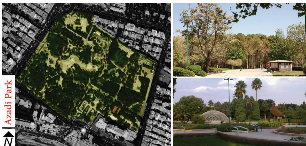
Figure 3. Aerial Photo of Azadi Park and pictures of its Space.