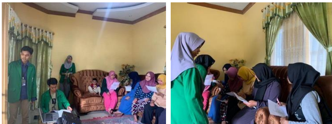
Figure 2. Hypertension counseling

After the presentation of the material, we shared a post test that aims to measure knowledge about hypertension, hypertension prevention, and hypertension management. The characteristics of respondents in counseling are described in table 1. Based on table 1. The distribution of respondents based on age in counseling activities in Balanglohe Hamlet was 3 people (10%) with vulnerable age 15-20 years, 11 people (36.7%) with vulnerable age 21-30, 8 people (26.7%) with vulnerable age 31-40 years, 7 people (23.3%) with vulnerable age 41-50 years, and 1 person (3.3%) with vulnerable age \geq 50 years. Meanwhile, the distribution of respondents based on gender in Hypertension counseling activities in Balanglohe Hamlet was 4 people (13.3%) male and 26 people (86.7%) female.